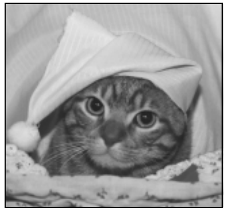
Call 678-9338 to pre-register for the Annual Spring Pet Show which will be held Thursday, April 4 at 10 A.M.

Wednesday, April 3, 2:15 - 5:45 P.M. Ice Skating Trip to the Long Beach Arena for grades 1 through 8. The $10 fee includes skate rental and transportation.