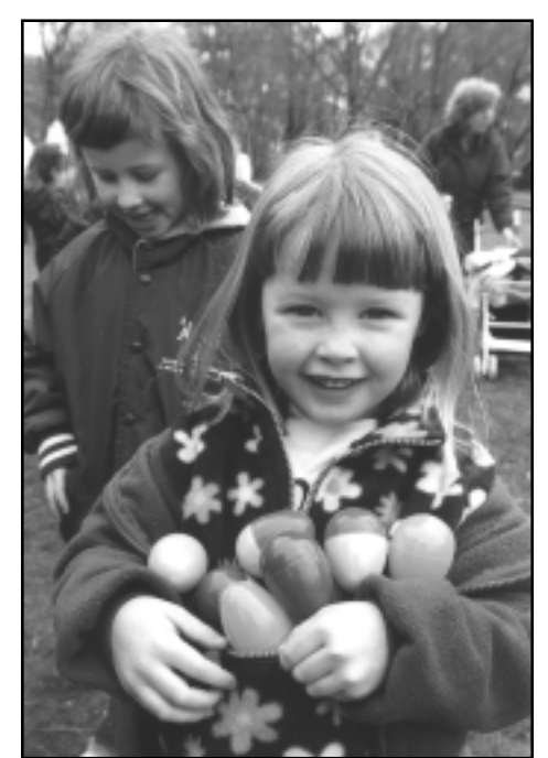
The Village's annual Easter Egg Hunt is 9:30 A.M. on Saturday, March 23.

The Recreation Department's Spring Crafts Fair and Flea Market is Sunday, March 10 from 9:30 A.M. to 4:30 P.M. There will be a large assortment of merchandise and plenty of free parking.