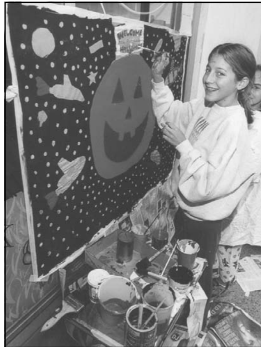
Sign up by October 11 for the Annual Halloween Window Painting Contest on Saturday, October 18.

Fill out a Goblin Slip at the party after the Ragamuffin Parade and you may receive a Goblin Call and a Goblin Prize on Halloween evening, Friday, October 31.