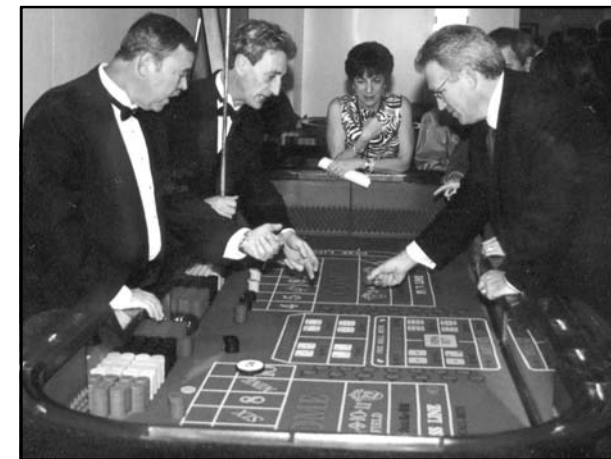
Save the Date: The Friends of Senior Services, Inc. (FOSSI's) annual Monte Carlo Casino Party fundraiser is Saturday, November 1.