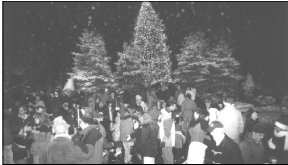
The Village's annual Christmas tree lighting is Thursday, December 4 at 7:30 P.M. on the Village Green, Maple and Lee avenues.

Deadline for tickets is Friday, December 12 for one of three seatings at 9:15, 10:30 or 11:30 A.M. Fee is $4 per person and tickets are available at the Rec Center.