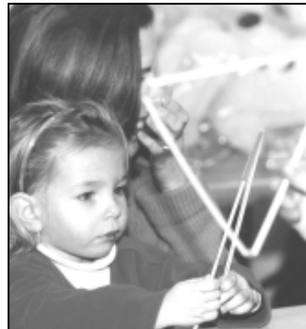
Children of all faiths are invited to enjoy crafts, music, and games at the annual Chanukah Party co-sponsored by the Rec Center and the National Council of Jewish Women on Monday, December 15 from 4 to 5:15 P.M.

Detailed flyers are available at the Rec Center.