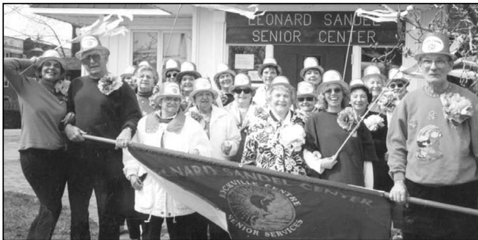
Join the St. Patrick's Day celebration at the Sandel Center on Friday, March 12 at 1 P.M.