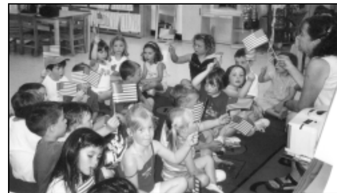
Register now for the summer and fall nursery school programs at the Rec Center.

The American Cancer Society's Daffodil Days benefit to remind us that hope blooms is scheduled for March 22 through 24. Last year more than 400,000