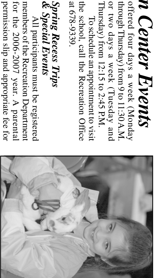
Center's annual pet Register your animal for the Rec Thursday, April 5. show on

Thursday, April 5, 11:15 – 12:30 or 12:55 - 2 P.M.