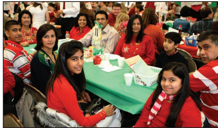
Bring the whole family to Breakfast with Santa's Helpers on December 13.

Registration is now being accepted for the 2010-2011 school year. Call 678-9238 for an appointment to visit. Tuition remains at 2009 prices.