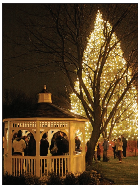
Join your neighbors on the Village Green for the Annual Christmas Tree Lighting on Thursday, December 10 at 7:30 p.m.

PRSR STD U.S. POSTAGE PAID Freeport, NY Permit No. 50