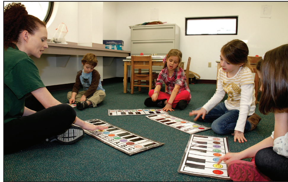
Happy Piano is a popular new program at the Recreation Center.

The Rec Center's 57th Summer Playground Program will be held from June 29 through August 11 from 9 a.m. to noon at three sites: The Rec Center, Wilson School, and Hewitt School, for children in grades 1 to 6 as of September, 2011. Daily activities include athletics, arts and crafts, recreational games and special events all conducted by trained recreation personnel. $467 per person.