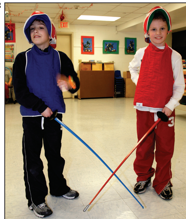
Fencing instruction is a new program available at the Rec.

Flyers are available for boys baseball, girls basketball, girls and boys lacrosse,