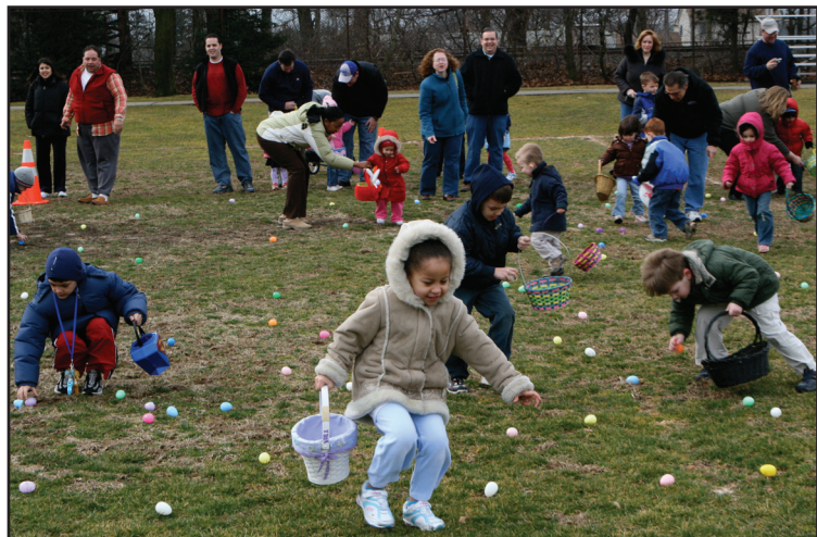
The Village's annual Easter Egg Hunt is 9:30 a.m. Saturday, March 31 at the Rec. Center's Veterans Park for boys and girls in pre-school through grade 4. In Rain date is Sunday, April 1 at 2 p.m.

The Recreation Department's annual Spring Crafts Fair and Flea Market is