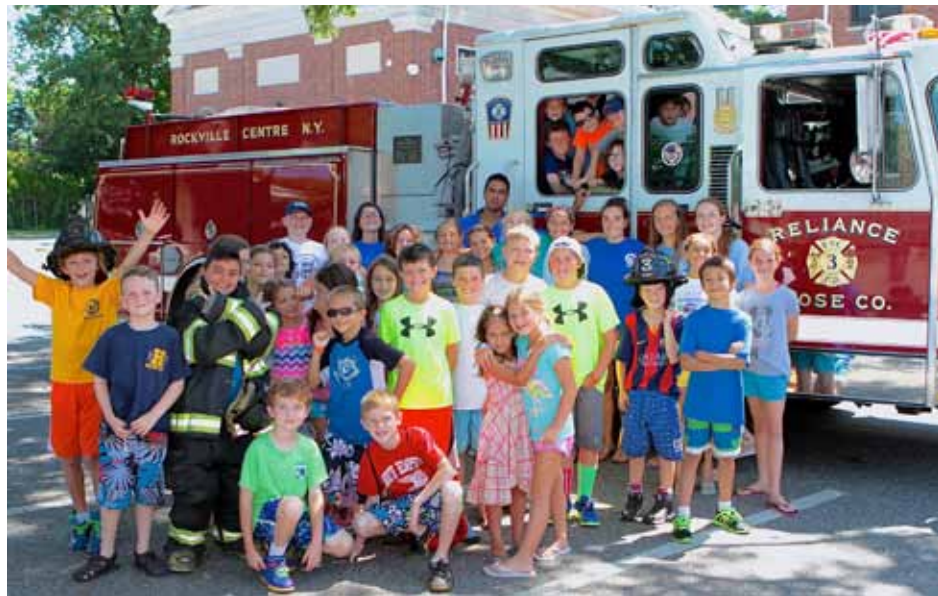
Summer Playground kids are excited about a visit from the Rockville Centre Fire Department

DETAILED INFORMATION FOR ALL ACTIVITIES CAN BE FOUND AT THE RECREATION CENTER OFFICE OR ON THE RECREATION CENTER WEBSITE AT WWW.RVCREC.WEBBLY.COM