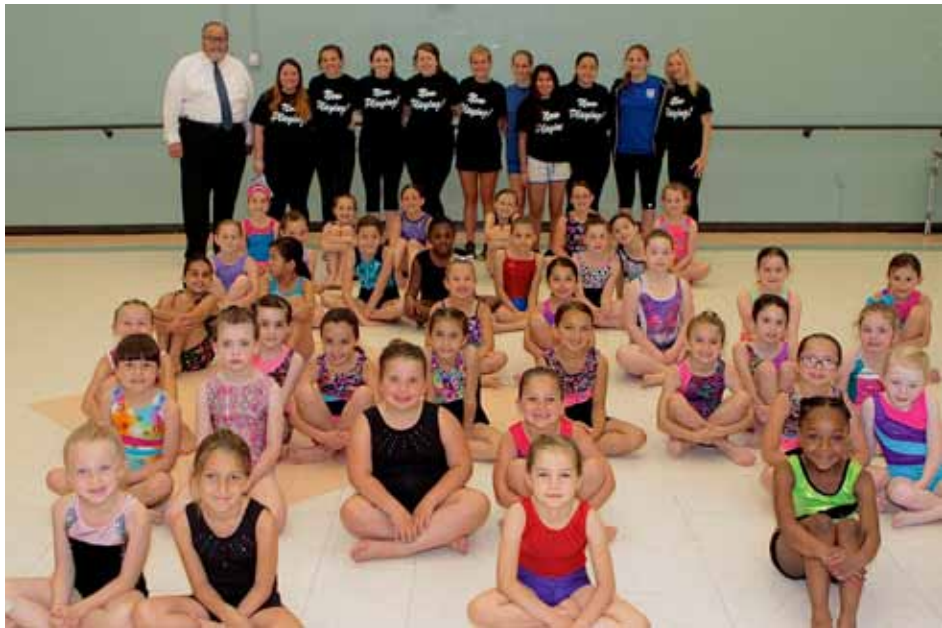
Mayor Francis X. Murray joined with staff members to give a pep-talk to gymnastics show participants