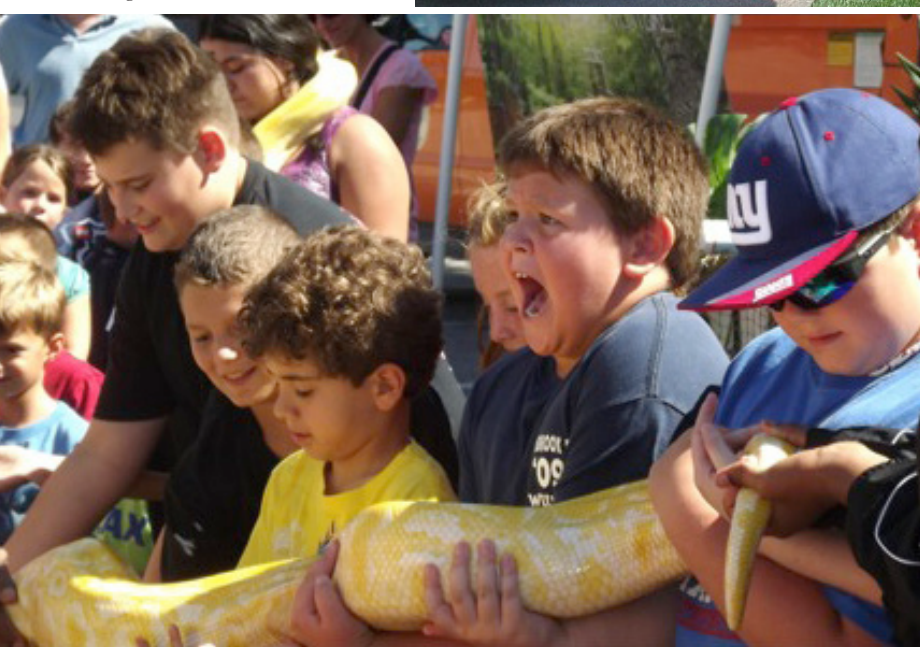
Come down for the annual KIDS'FEST on September 17th. Kids can enjoy rides, face painting and a variety of exhibits and demonstrations including Erik the Reptile demonstration.